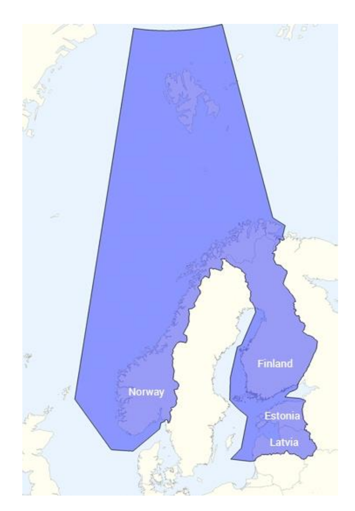
Figure 1 NEFAB airspace

NEFAB airspace (Fig.1) is composed of the following flight information regions (FIR) and upper information regions (UIR) of the North European airspace: Estonia, Finland, Latvia, Norway, and Bodø Oceanic.